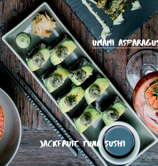
JACKFRUIT TUNA SUSHI