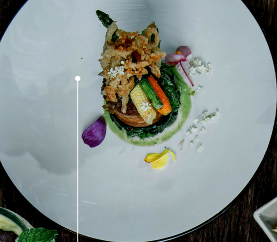
JACKFRUIT FILLET STEAK