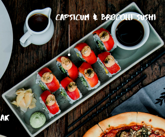
CAPSICUM & BROCCOLI SUSHI